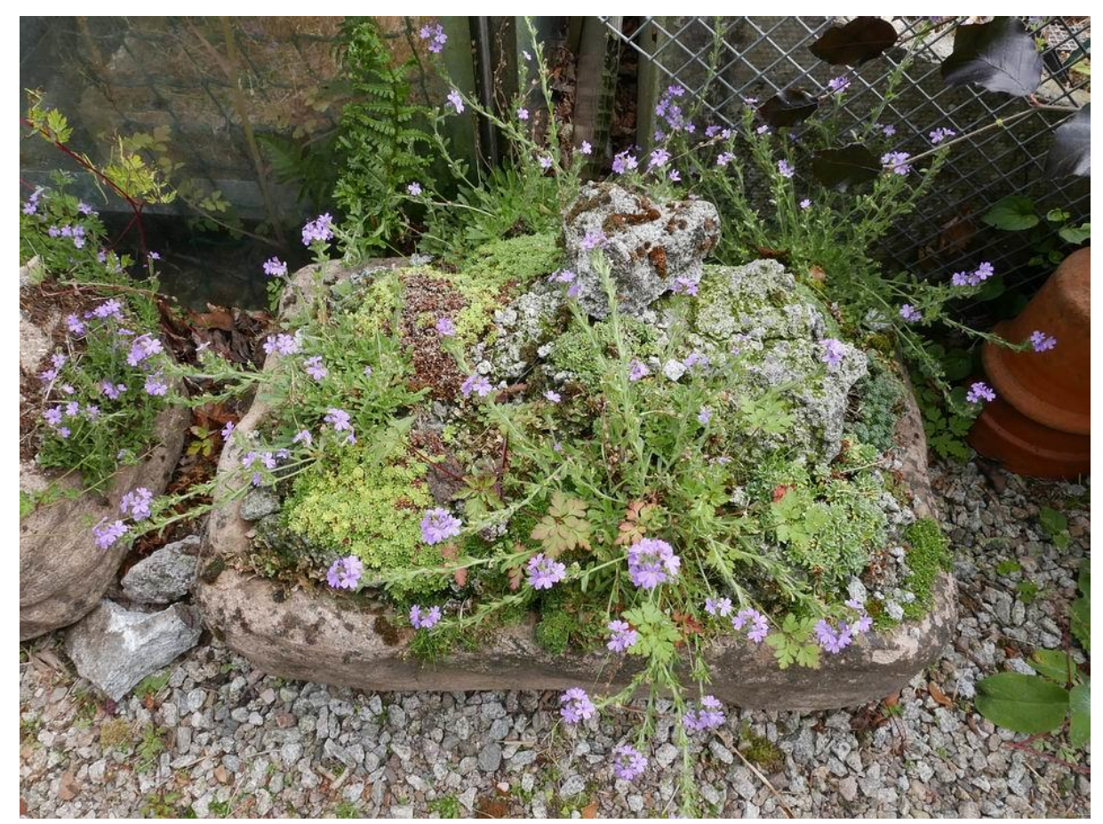
Compare the state of this trough which was exposed to more sun with the one below which was in shade for much of the day.