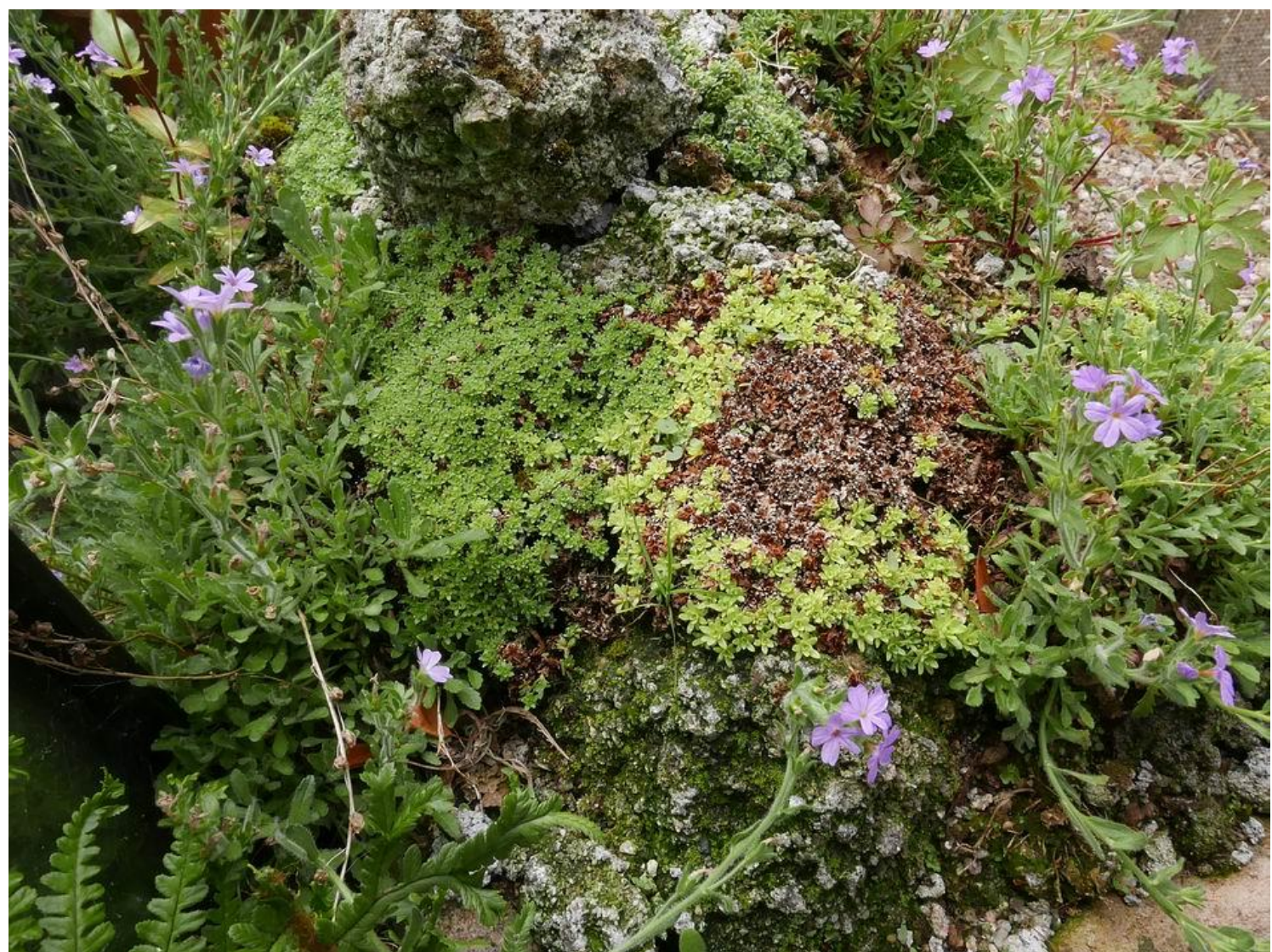
Over many years I have selected and propagated from the plants that best tolerate our normal cool moist summers and this year some of them are facing a new challenge of getting scorched in the sunshine. Because of our cool climate I have not previously had to consider the positioning of these troughs but this year has highlighted the benefit of having the troughs in some shade – in most normal years I describe Scotland as being in shade.