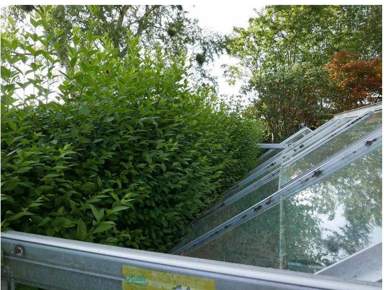
It is time for the annual hedge cutting and I have been working my way around, cutting them hard back.