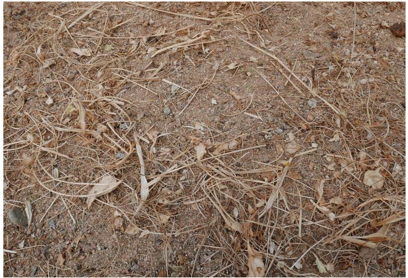
While I do have to work my way through repotting all the bulbs in pots over the next month the sand beds require much less work.