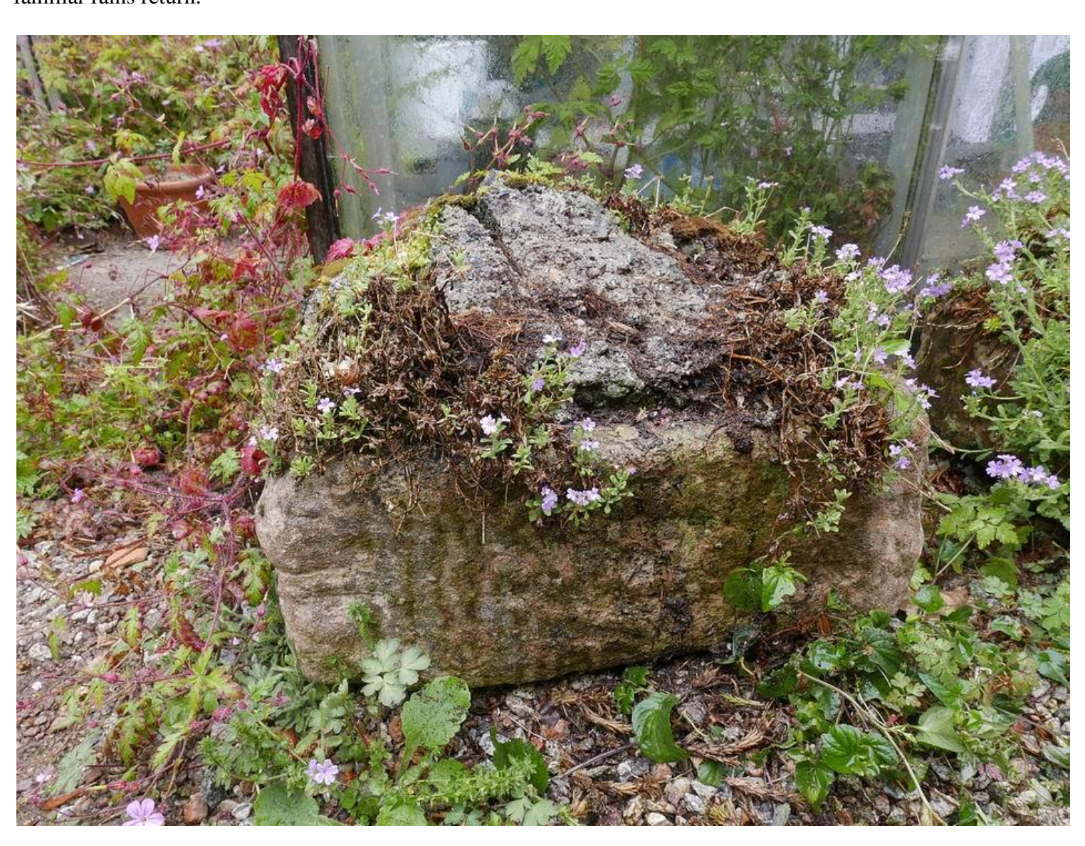
familiar rains return.

The picture below shows the dead remains removed to reveal the rock work. I will rework and plant this trough when the weather cools down and the