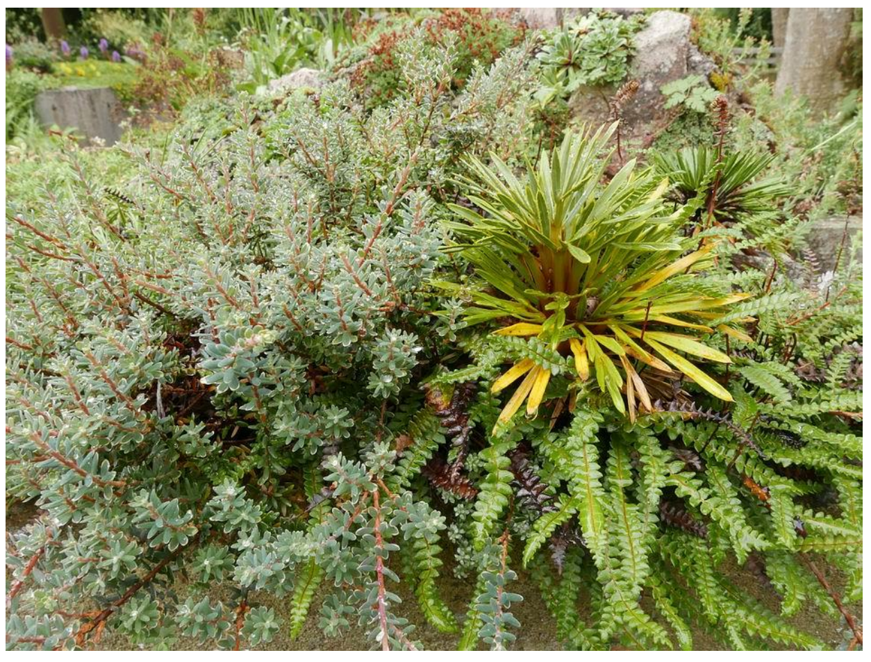
This trough is planted with New Zealand plants including Aciphylla, Cyathodes and ferns.