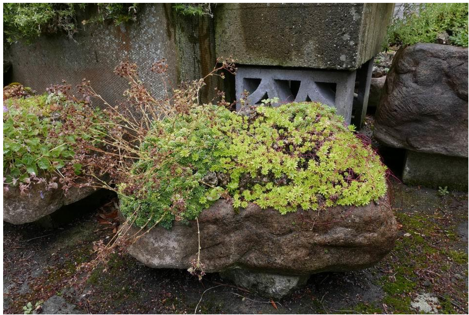
There are three saxifrages in this trough one flowers in the spring, the one on the left flowers in the summer and the pale green rosettes are Saxifraga brunonis which produces small yellow flowers in late summer into autumn.