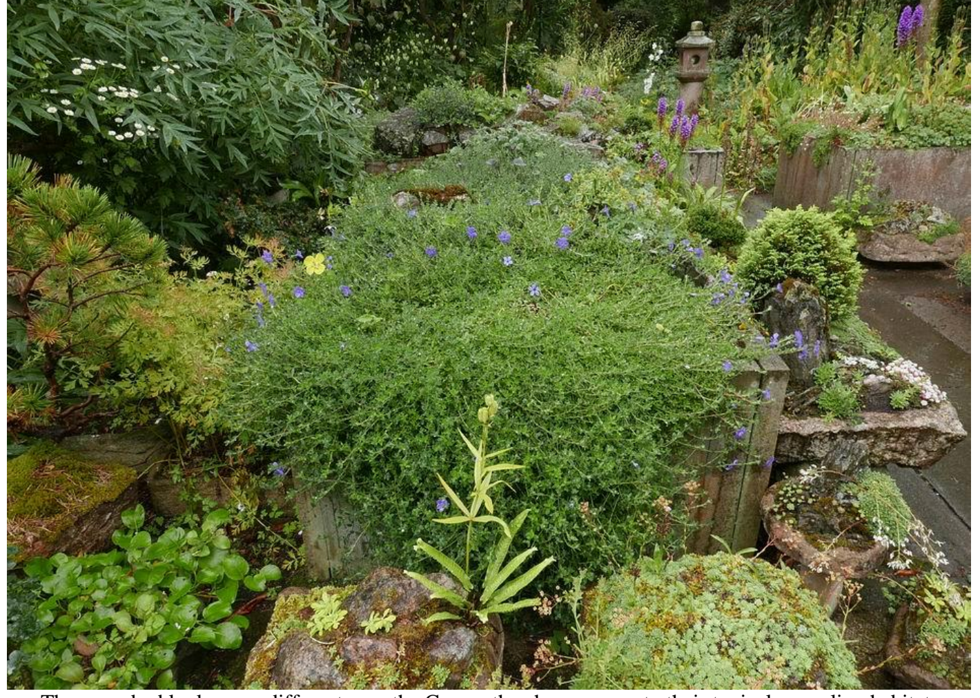
The same bed looks very different now the Cyananthus have grown to their typical sprawling habitat.