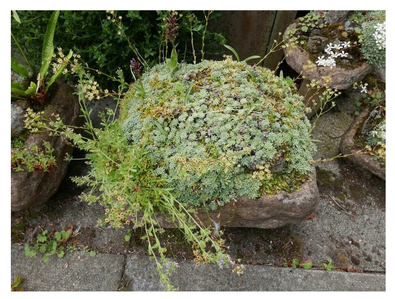
Another silver saxifrage covers this trough and has been joined by Erinus alpinus and Dactylorhiza orchids which have seeded in.