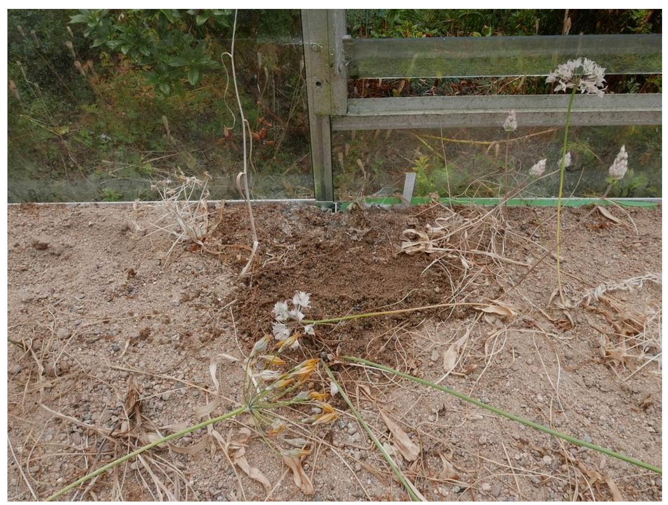
One thing I will have to watch was highlighted in the recent rain which revealed a leak in the roof - I will either have to sort the drip or respond by using bulbs that can tolerate or require a moist summer around that small area.

I am very encouraged so far with bulbs are growing well long term I will have to lift and divide the bulbs that form clumps and will also have to remove some of the surplus to prevent the sand bed from becoming over crowded