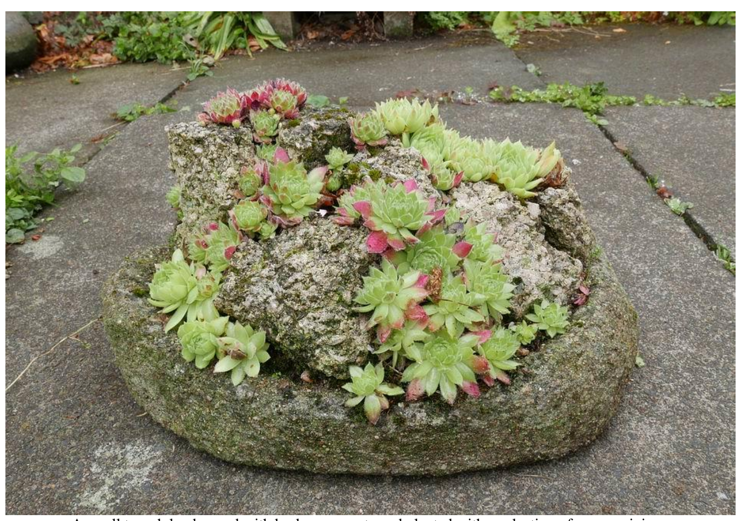
A small trough landscaped with broken concrete and planted with a selection of sempervivium.