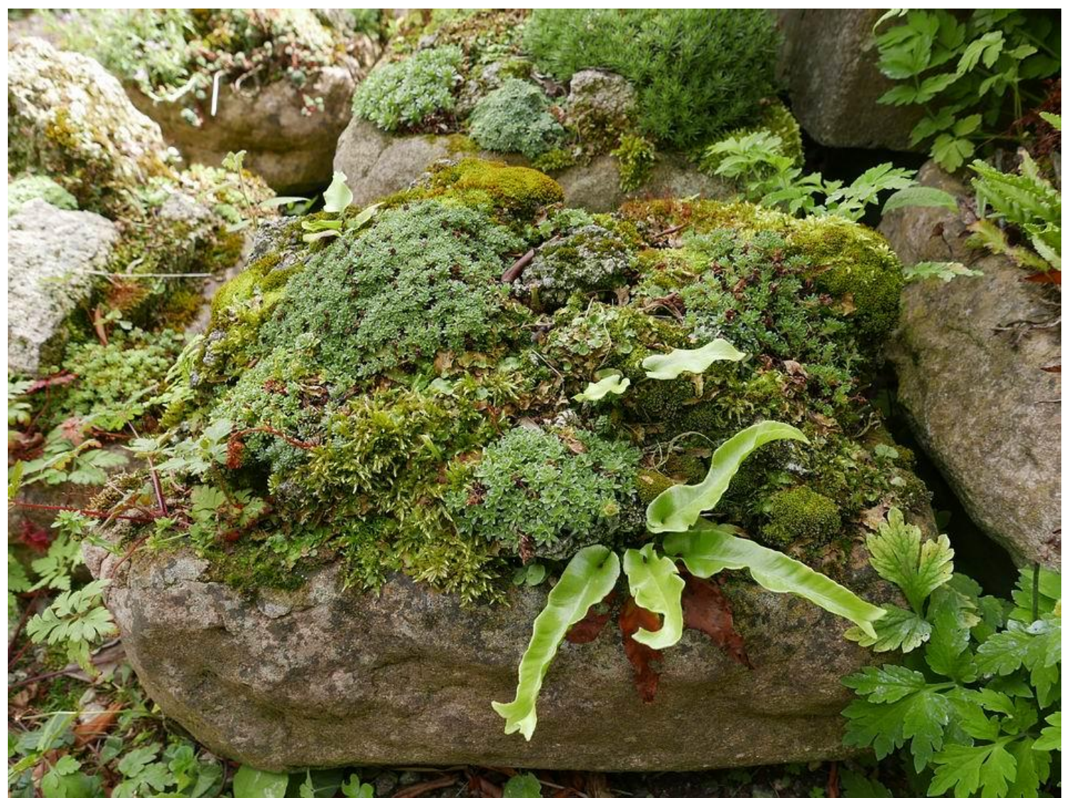
Gardening is a continual learning process and as the positioning of the troughs is something I have to reconsider or I have to adapt the planting to plants that can tolerate the warmer sunnier conditions.