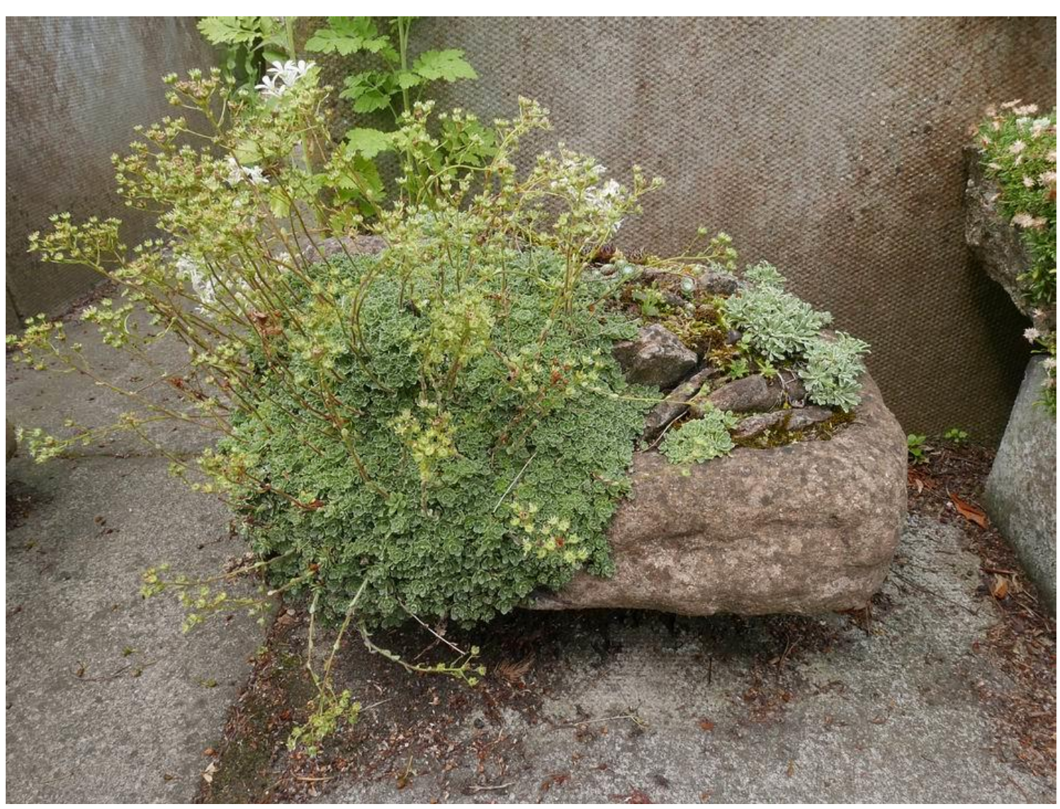
One of the keys to being considered a good gardener is knowing the plants that grow well for you. Over the years Saxifraga cochlearis minor, seen here taking over one side of this trough, has proven itself here.