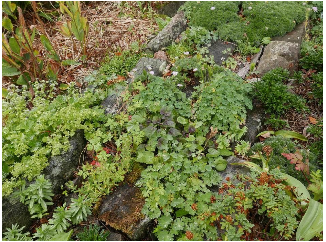
As the flowers last a short time I plant the troughs as I do the rest of the garden with foliage in mind – the next sequence of images show the variation and interest the foliage delivers.