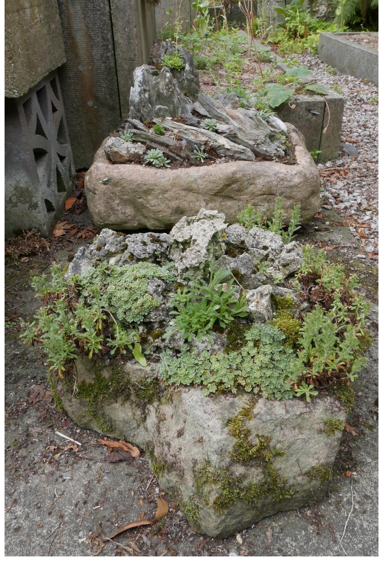
I landscaped the trough in the background a number of years ago but did not plant it however I let a mossy saxifrage that seeded in grow and as you see it covered the entire trough hiding the rocks with the exception of the large upright one. A month ago I removed the

mossy saxifrage to reveal the rock and planted it up with cuttings that I had taken in the early spring picture on the right and below.