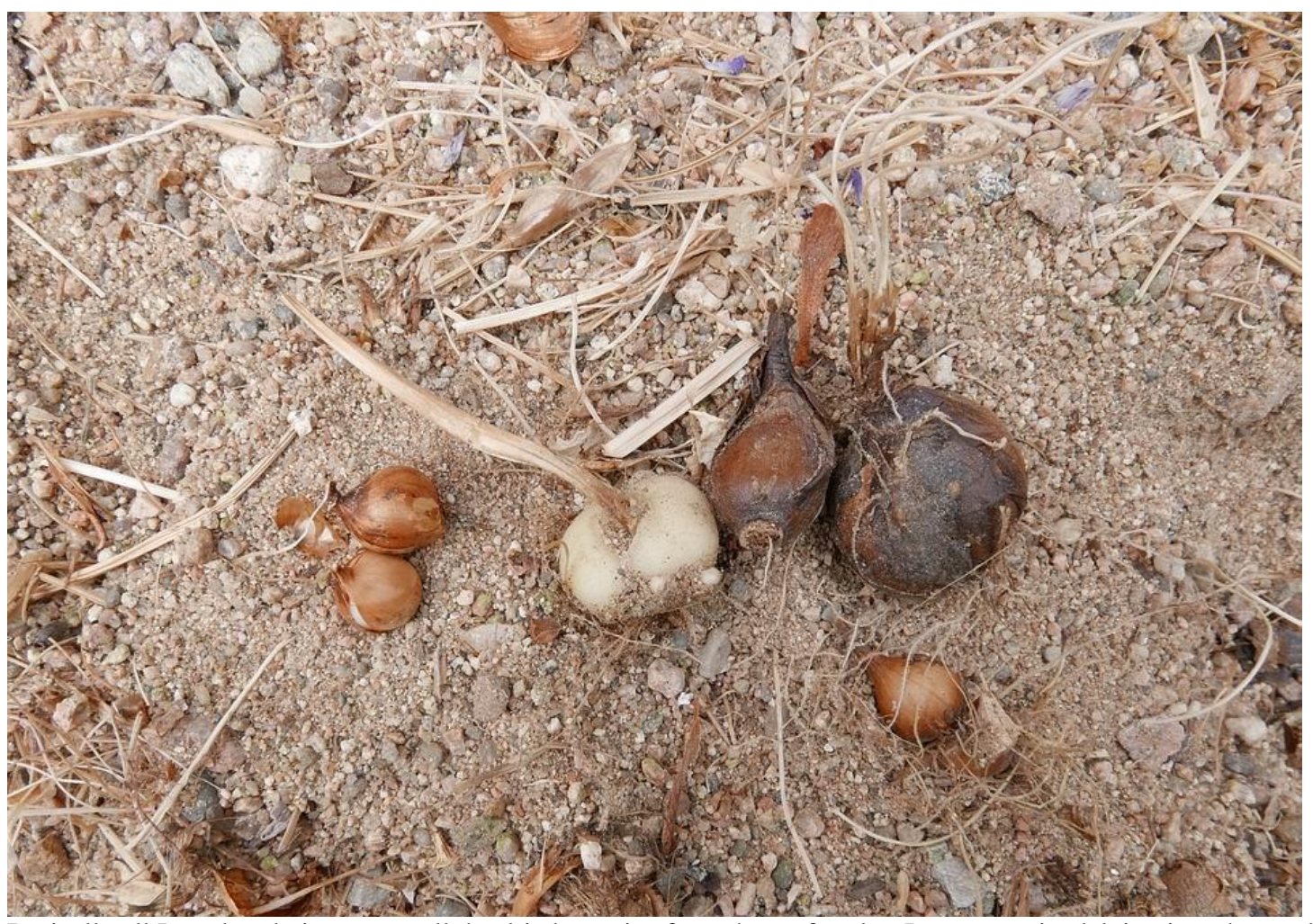
Basically all I need to do is remove all the dried remains from the surface but I cannot resist delving into the sand, like a lucky dip, to see how the bulbs are growing.