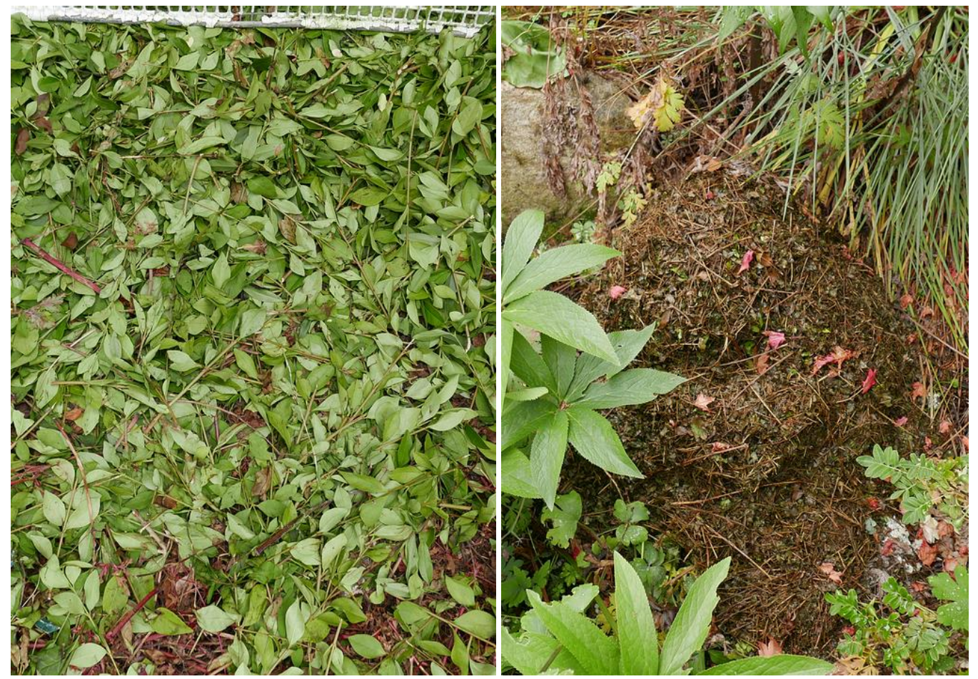
Hedge clippings are shredded then piled to compost for a few months before beiing spread out as a mulch.