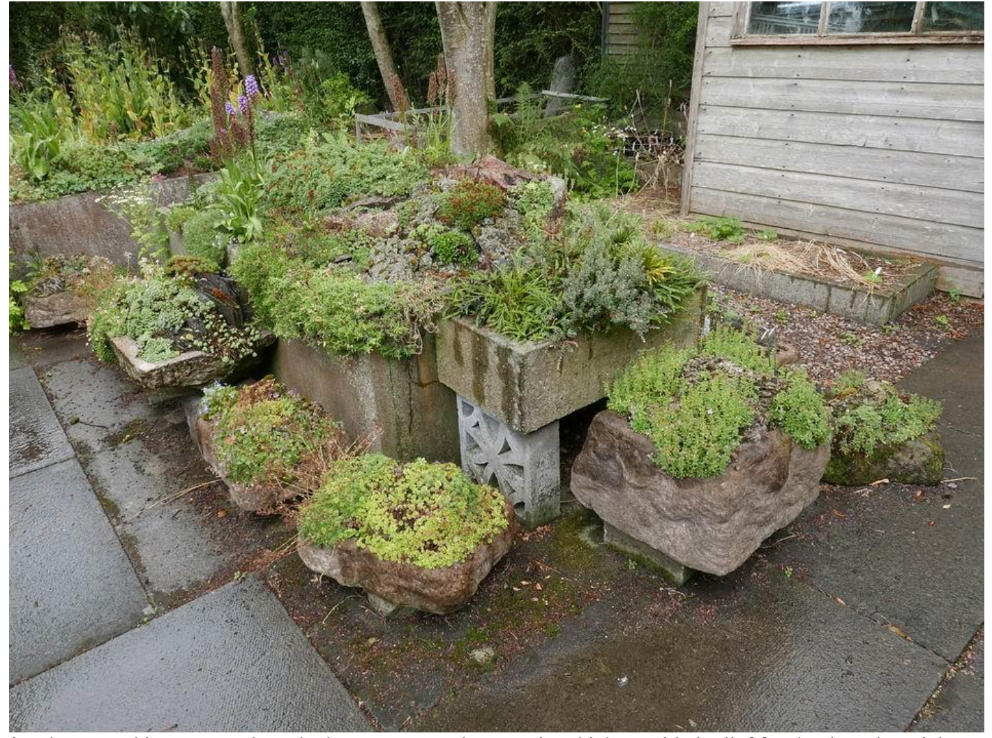
Notice the ground is wet – we have had some very welcome rain which provided relief for the drought stricken plants. No amount of water from a hose or watering cans can ever provide the same benefit of some natural rain.